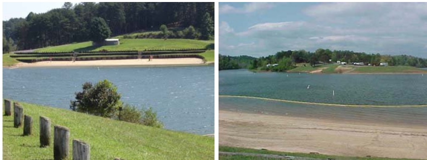
Left pic: of Berry Mtn from Bandits Roost.